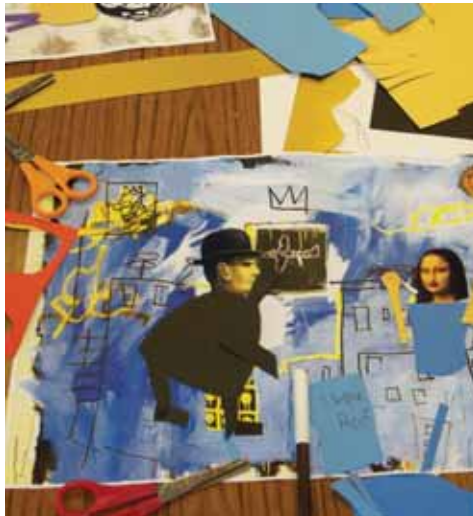
Shorts, Preparatory shot for film produced during Masterpiece Movies workshop

A collection of short films created by young people in various Oriel Wrexham film-making workshops. The films are based on short stories produced using stop motion animation and long exposure photography.