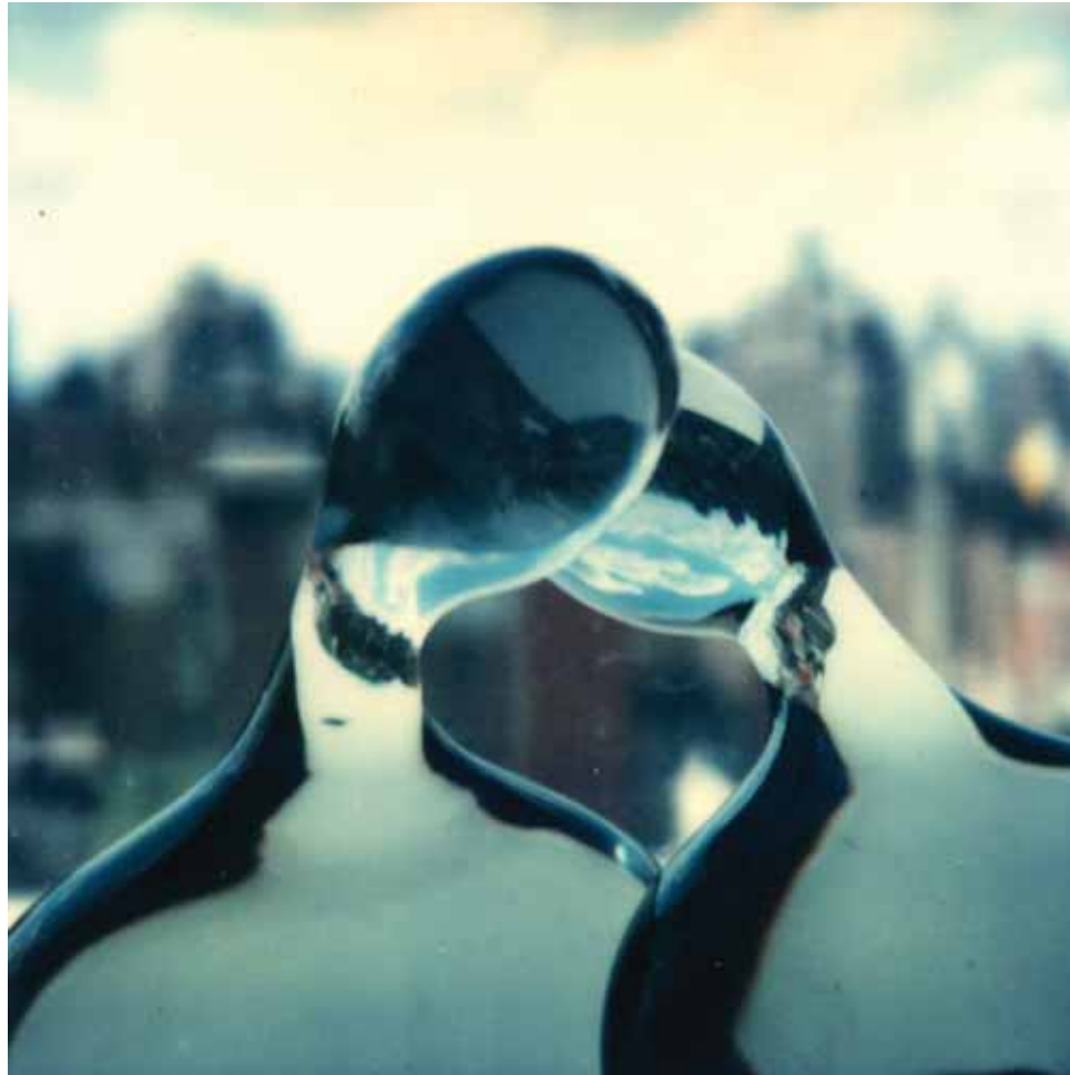
André Kertész, August 16, 1979, Polaroid SX-70 Photograph.