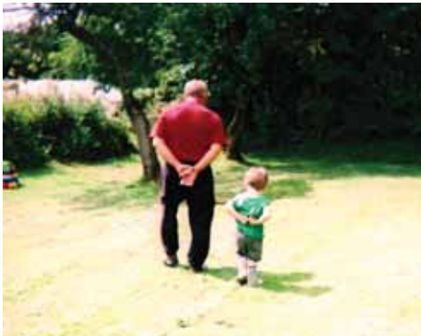
Photomission, Photographs produced by Brynteg Young People's Centre

The everyday objects, signs and symbols that provide meaning but go unnoticed are the source of inspiration in this collection of images.