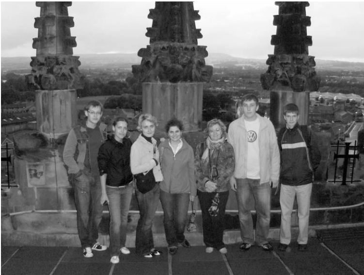
Young visitors from Moscow at the top of St. Giles's Church tower

Website at www.wrexham.gov.uk/english/heritage/forum