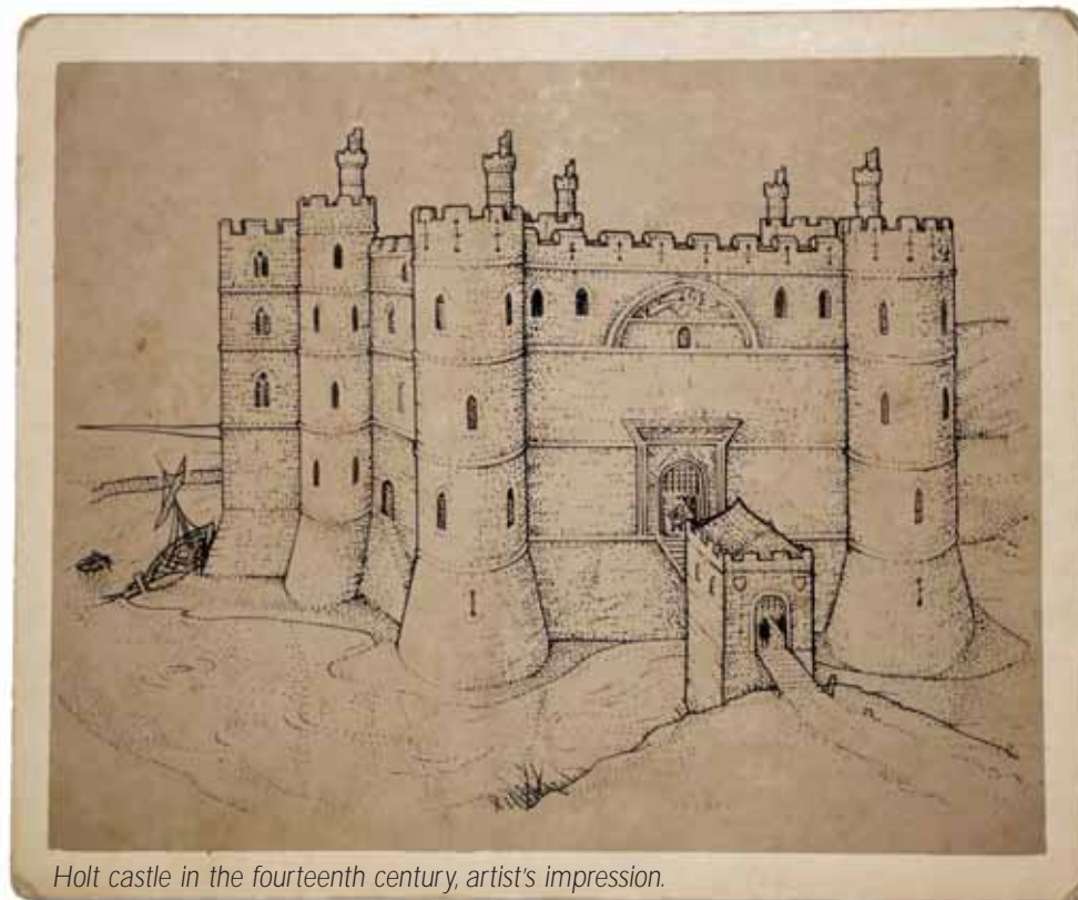
Holt castle in the fourteenth century, artist's impression.

Park in the centre of Holt village, follow Church Street in the direction of Farndon, about 100m from the village centre take the footpath to the right signposted to the castle.