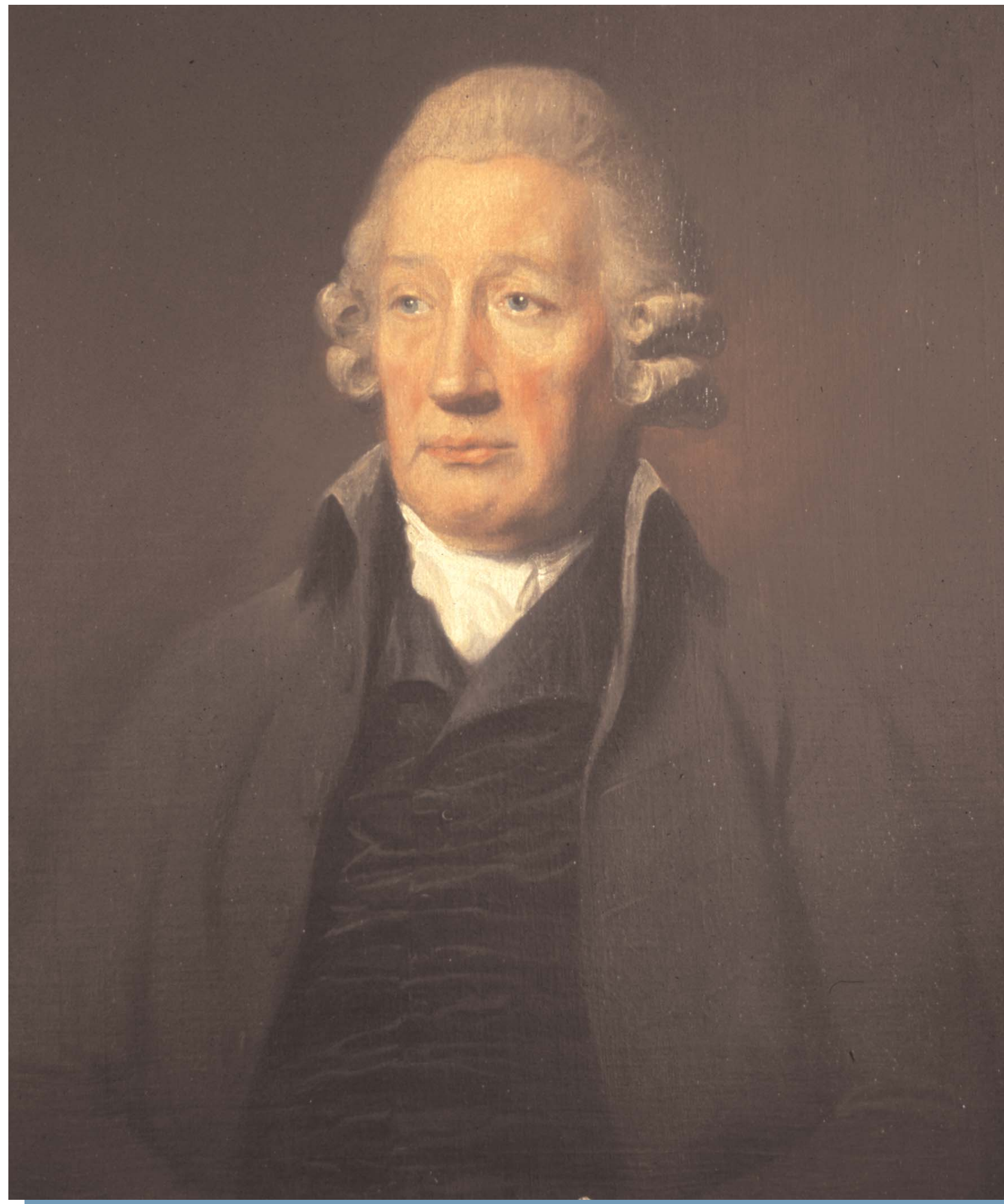
John Wilkinson, 1728 - 1808 by Francis Lemuel Abbott John Wilkinson, 1728 - 1808 gan Francis Lemuel Abbott

John Wilkinson was a famous eighteenth century ironmaster, inventor and entrepreneur. He was known as 'Iron Mad Jack' because of his obsession with iron.