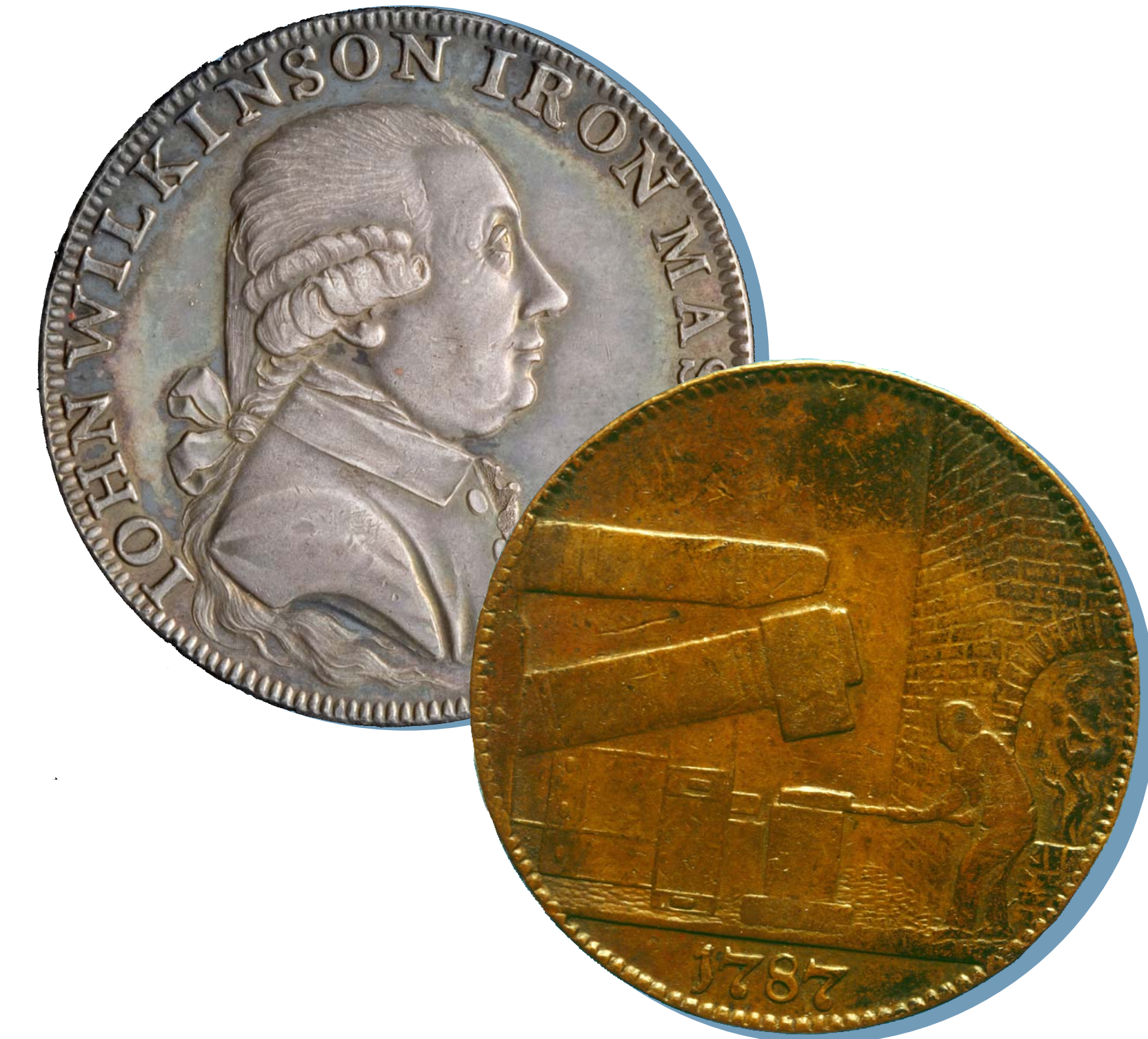
John Wilkinson paid his workforce using tokens. Despite this, he was a popular employer Talai John Wilkinson ei weithlu â thocynnau. Er gwaethaf hyn, roedd yn gyflogwr poblogaidd