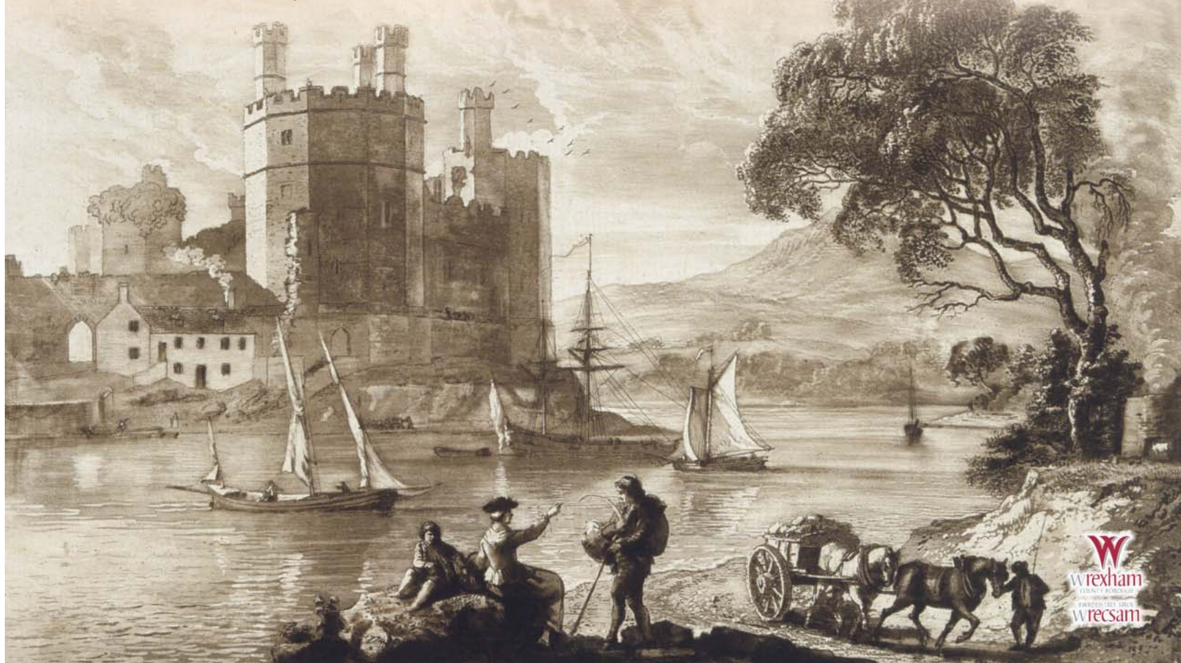
Caernarvon Castle, Paul Sandby, 1777.

Exhibition Curator - Curadur yr Arddangosfa: Paul Heron.