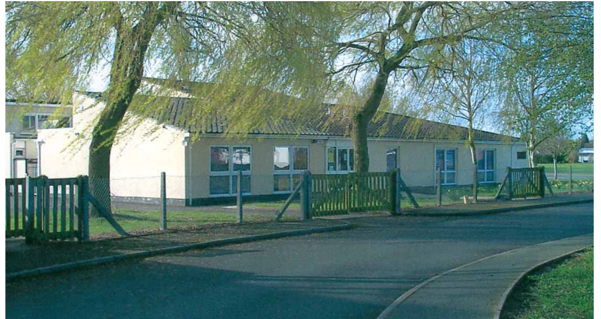
New School, Ysgol Sant Dunawd, Sandown Road - Ysgol newydd Sant Dunawd, Ffordd Sandown

"Mae'n rhaid fy mod wedi mynd yno (i'r hen ysgol) yn 1964. Roedd yn adeilad hen iawn - brics coch. Nid oedd llawer o wres - hen dân - dim byd modern o gwbl. Roeddem yn bwyta yn yr ystafell ddosbarth. Roedd cinio ysgol yn sylfaenol iawn - tatws, selsig a llysiau - ddim yn debyg i heddiw."