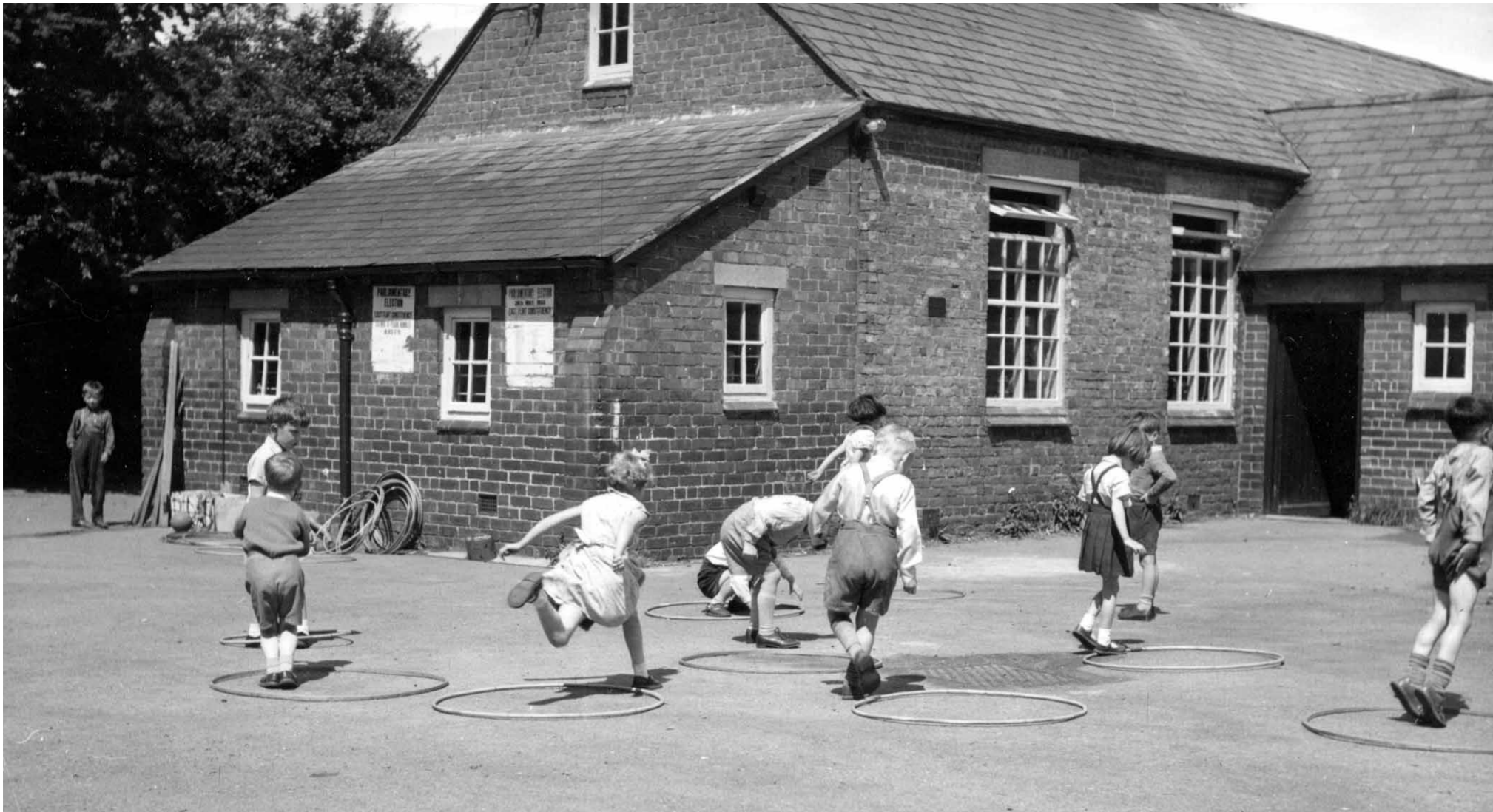
Old school and yard, off the High Street - Yr Hen Ysgol a'r buarth ger y Stryd Fawr