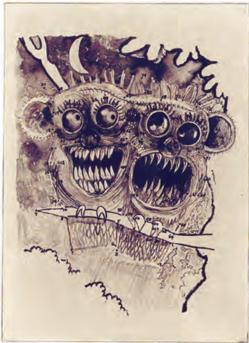
My Giant Colouring Book 20, 2004 Copyright Jake and Dinos Chapman and The Paragon Press, London