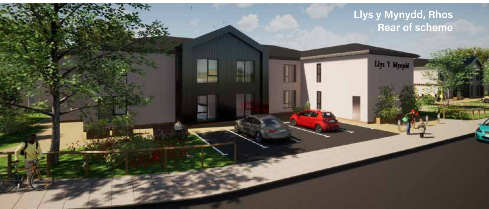
Llys y Mynydd, Rhos Rear of scheme

“The schemes have been designed to provide a ‘Home for Life’, where generations and communities can come together to support families to live well. Designing contemporary internal spaces that fully support all people’s needs, irrespective of age”