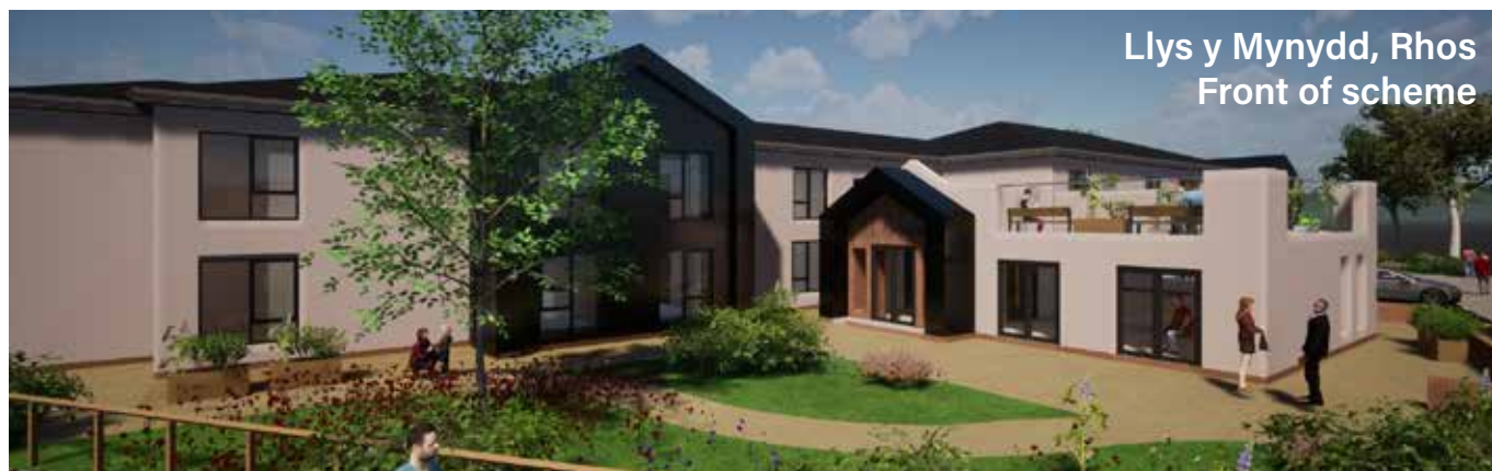
Llys y Mynydd, Rhos Front of scheme

For more information on the Remodelling and Refurbishment programme please contact us at; olderpersonshousing@wrexham.gov.uk or call us on 01978 298993