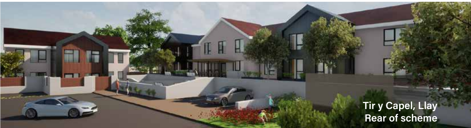
Tir y Capel, Llay Rear of scheme