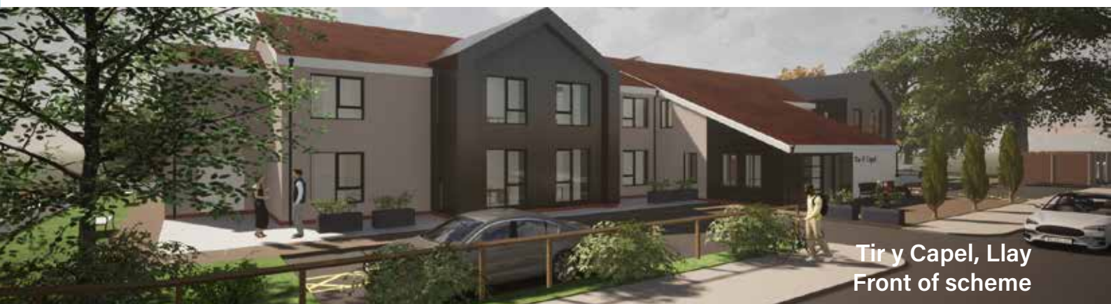
Tir y Capel, Llay Front of scheme