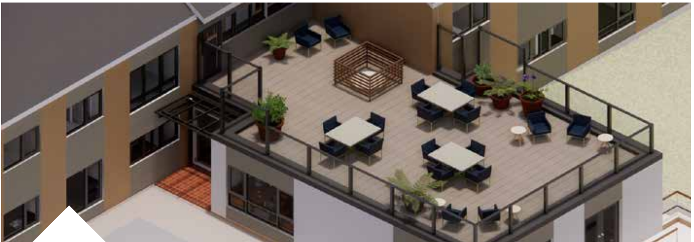
Artist impression of the external improvements and roof terrace at Royal Court, Gwersyllt.