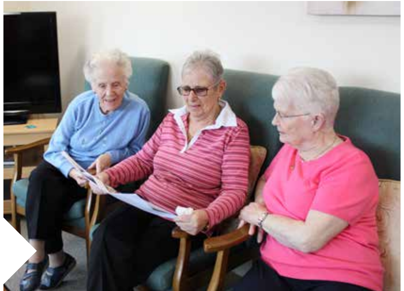
Tenants at Royal Court, Gwersyllt

As soon as it is safe to do so, we will meet with tenants at Royal Court again.