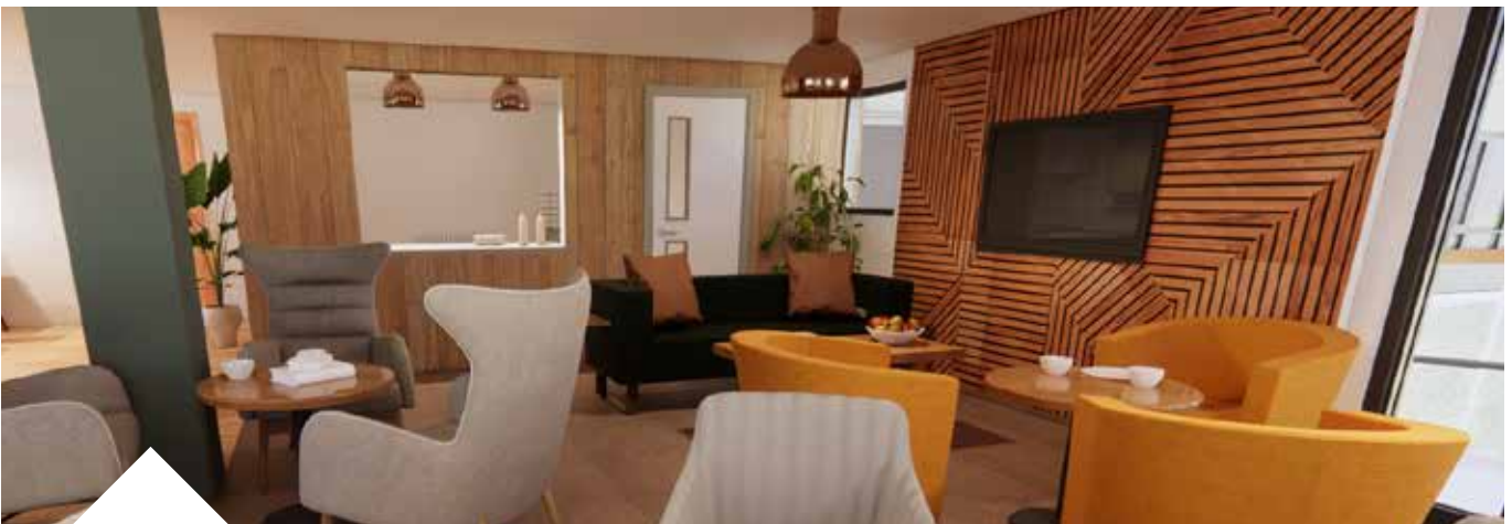
Artist impression of the refurbished communal lounge at Royal Court, Gwersyllt.