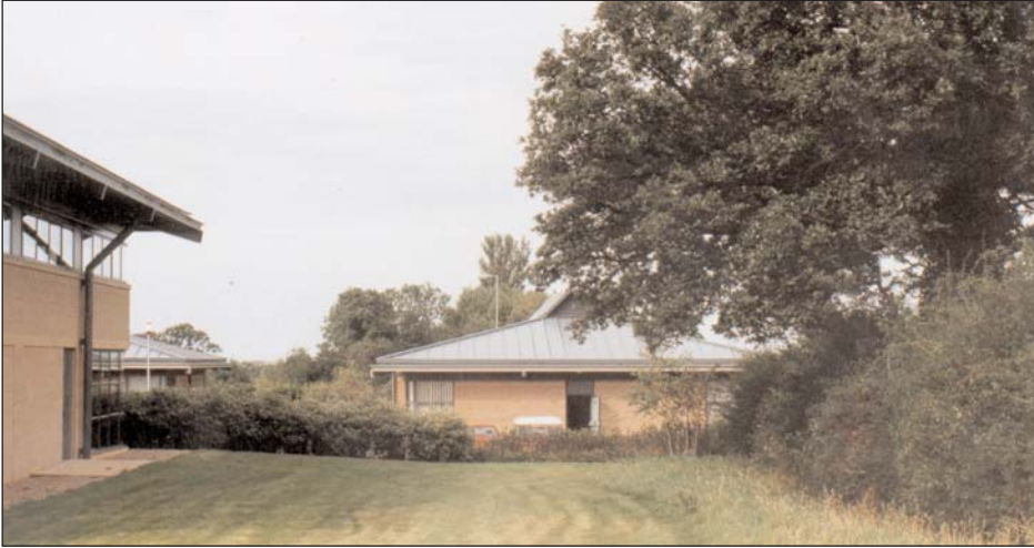
Hedgerows and trees retained in this North Wales business park