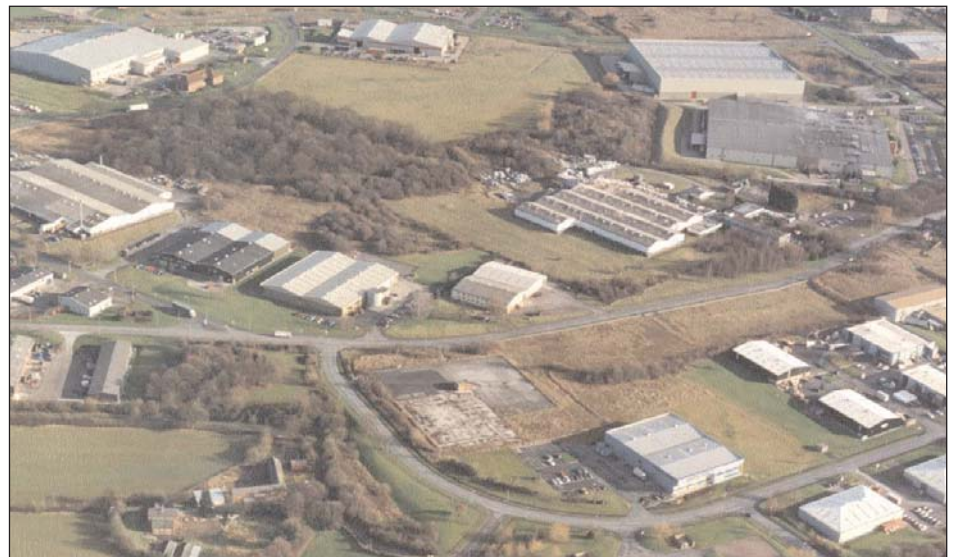
Aerial view of Wrexham Industrial Estate

Much of the advice contained in local planning guidance note no. 7 'Landscape and Development', to which applicants are also referred, will be relevant to industrial development, particularly the advice on what needs to be submitted as part of the planning application. Information Sheets on a range of landscape topics are available from the Planning Department, and reference can be made, on request, to detailed assessment reports on Wrexham and Llay industrial estates. Site development briefs may have been prepared by the Planning Department for major employment sites.