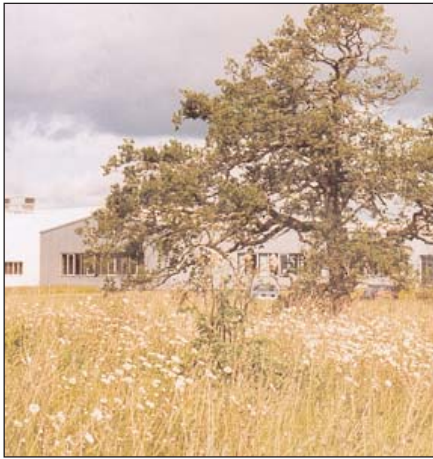
Natural grassland and oak tree Wrexham Industrial Estate