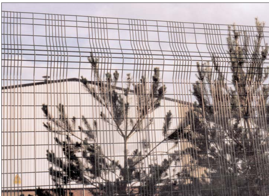
'Paladin' security fencing