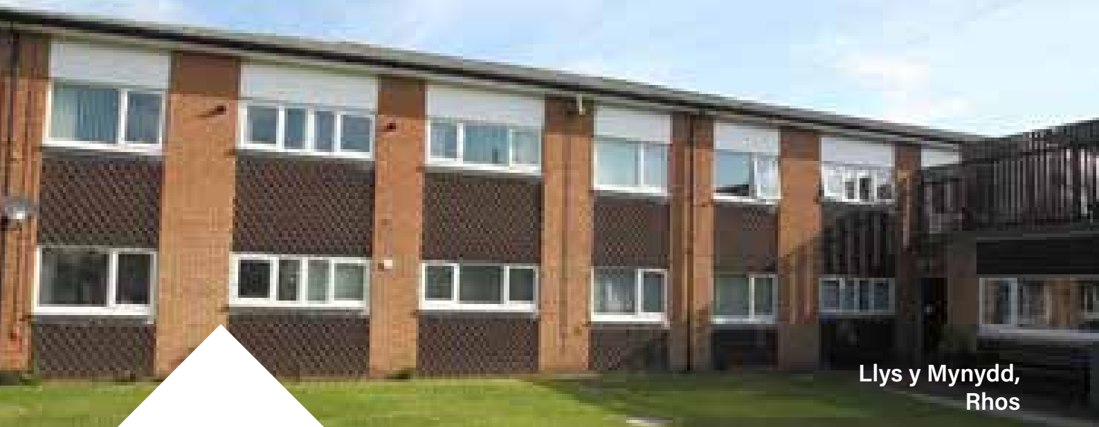
Llys y Mynydd, Rhos