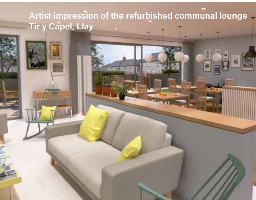
Artist impression of the refurbished communal lounge Tir y Capel, Llay

The plans for the 2 schemes are well underway.