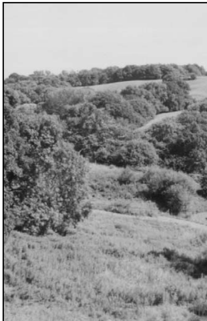
Woodland and grassland habitat for badgers